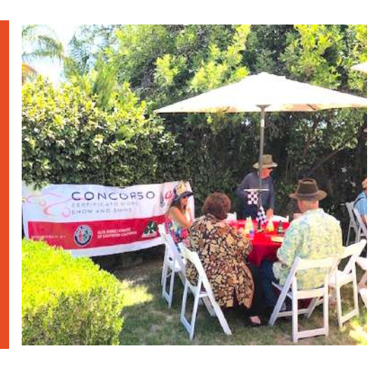
Celebrate summer with Alfisti friends How? Where? Info on page 4.

Newsletter of the Alfa Romeo Owners of Southern California