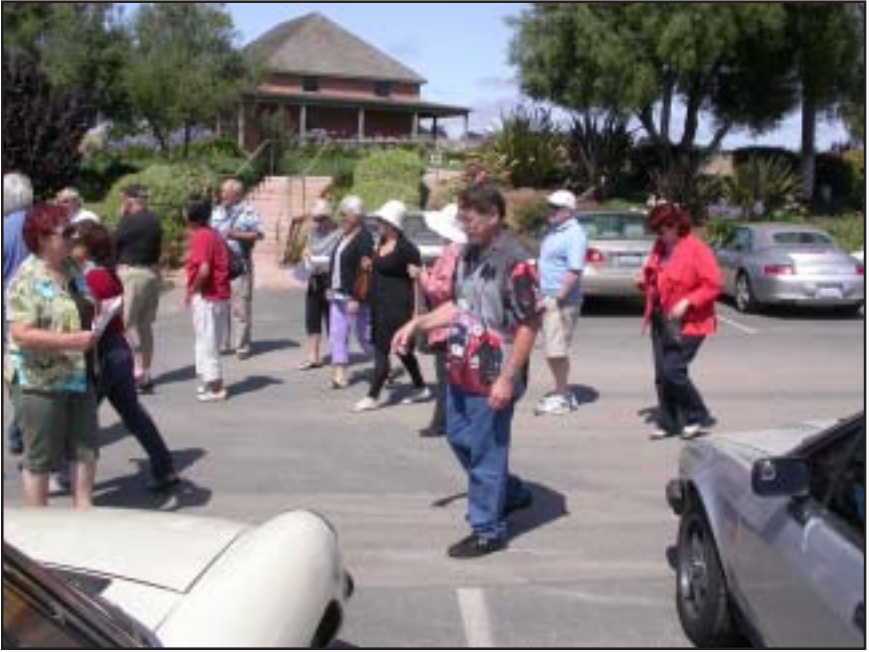
Wine tourers gather at the Talley parking lot.