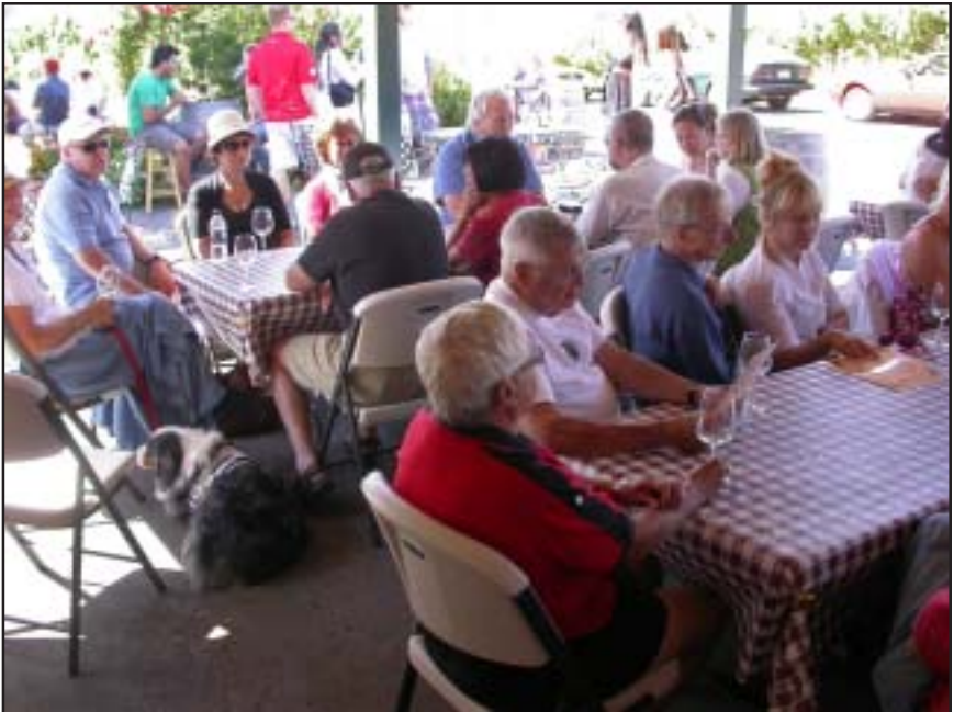
Making choices at Wolff Vineyard