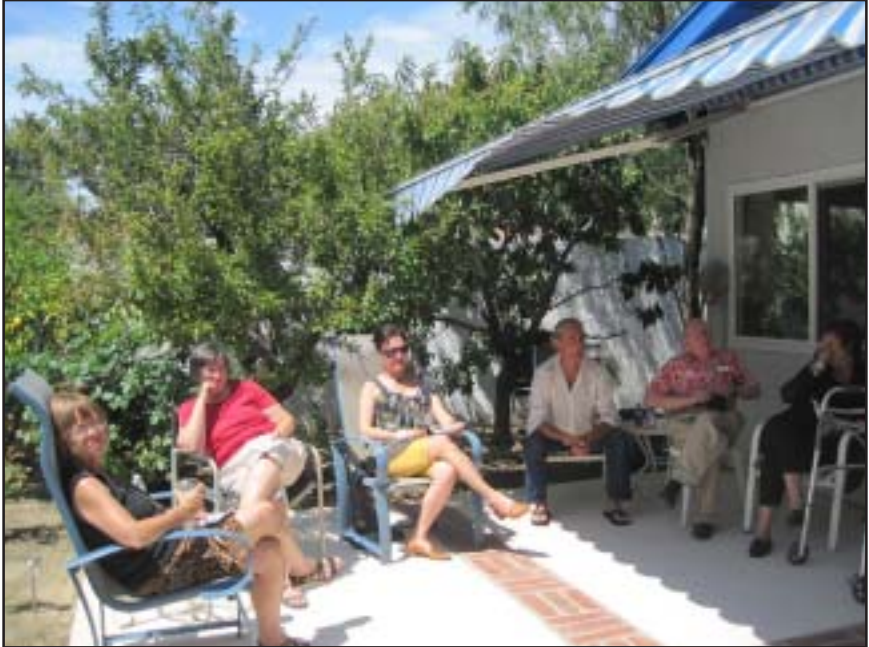
This group found the comfortable chairs, and endured some sun.