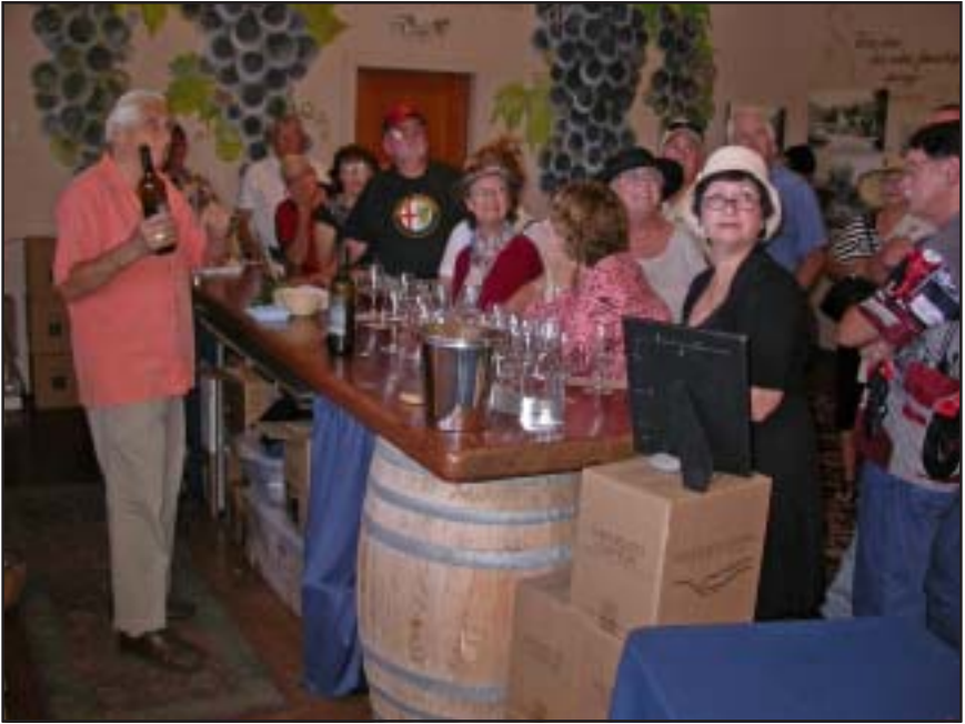
Tasting at Saucelito Canyon -- the Zin was yummy.