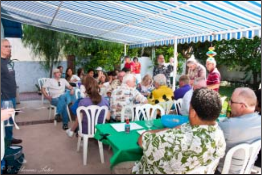
We had one of the largest crowds ever at the Summer Party.