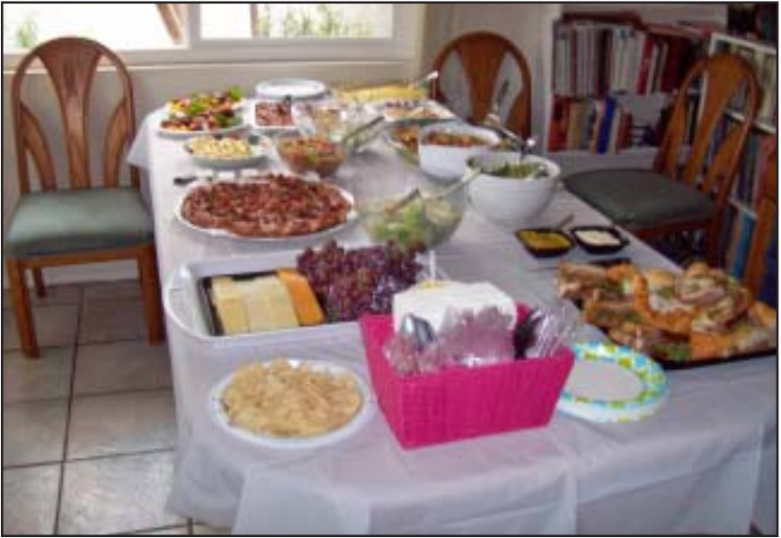
The food table before the hungry hoard got there.