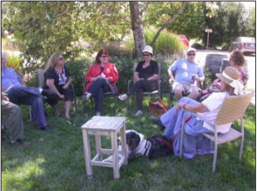
The pause that refreshes -- quality Alfa time at Saucelito Canyon