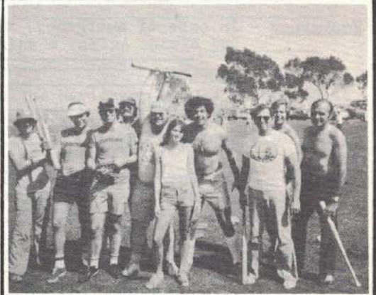
MANY OF THE AROSC STARS POSE FOR A GROUP PICTURE - WE HAD 14 PLAYERS ON THE FIELD!!!

Why weren't you among the 25 AROSC members and family who played, watched and picnicked? It's because you weren't at the general meeting when plans for the June game were announced. All we can say is, boy, did you miss out! The San Diego Club also had a good turn out, and Crown Point Shores, on the grass by Mission Bay, was a great spot to beat the heat of L.A. We saw a lot of new faces at this event and hope that yours will be one of them next year!