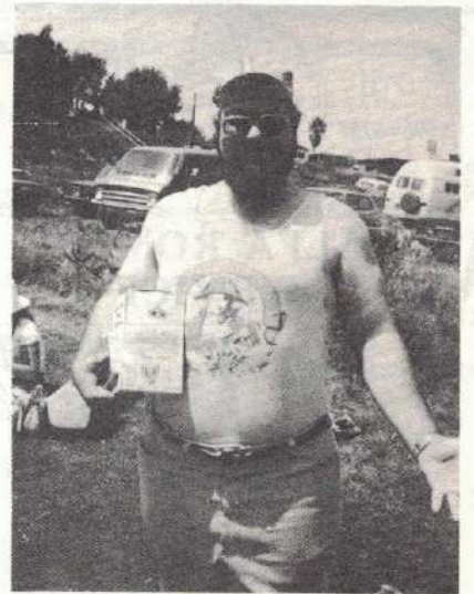
Bear arrived with enough chicken to feed an army...himself!