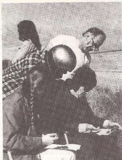
PHOTOS OF AROSC'S EVENT AT WILLOW SPRINGS - NOVEMBER - 1973

If you didn't participate as a worker or a driver in either event in 1972, just talk to anyone who did and I'm sure you'll decide to join us at our first event in 1973. We all had a great time--and, after all, that's the purpose of the whole thing! Lastly, remember that to compete in these events, you don't have to be an expert race driver, but you must definitely be a sensible driver--know your limits and drive within them.