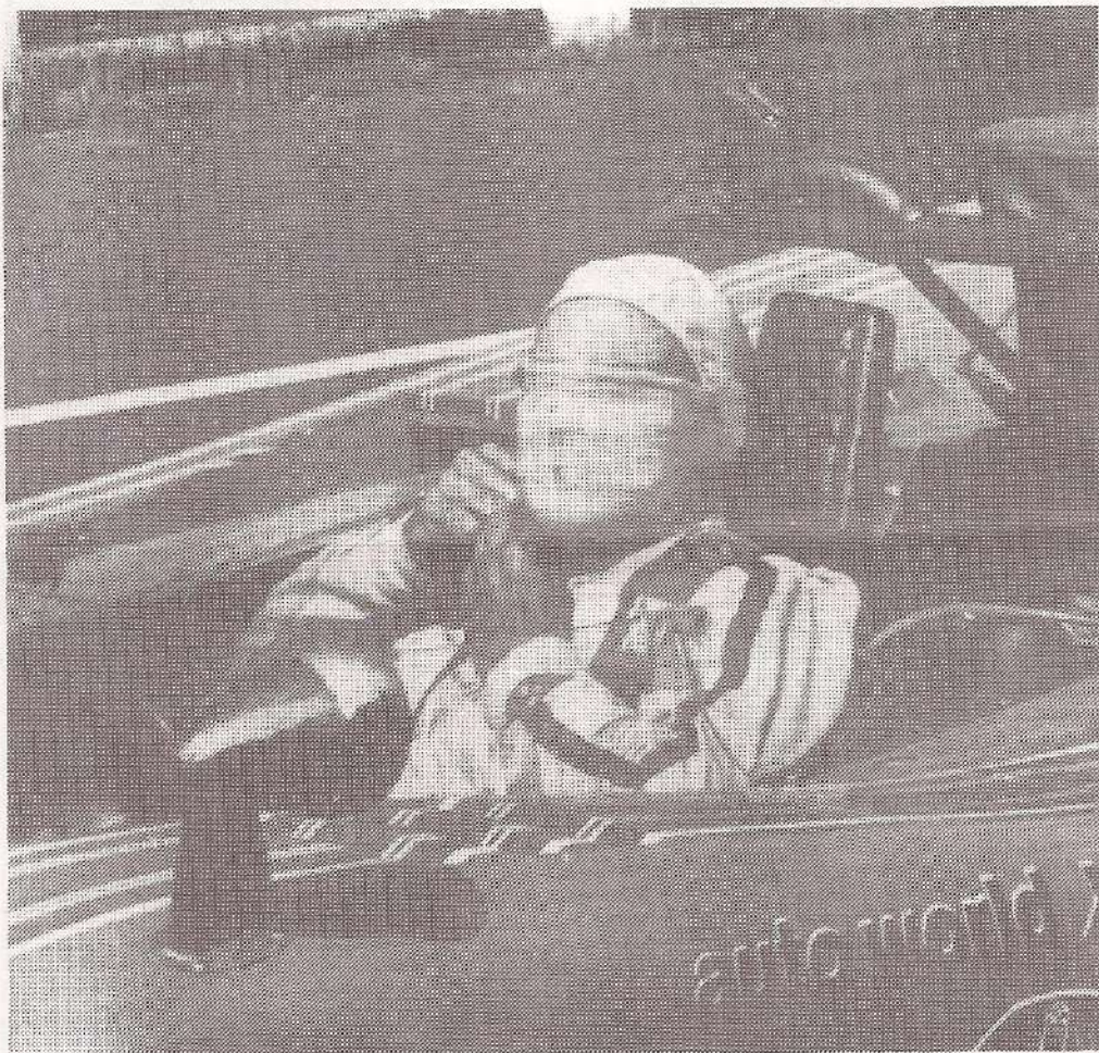
Polish race driver prepares for battle.

206 ROAD & TRACK 25th ANNIVERSARY