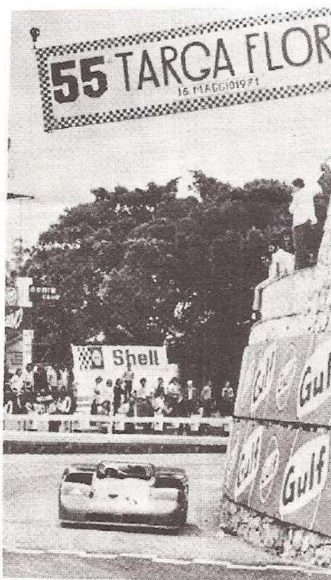
WINNING T-333 AT TARGA FLORIO DRIVEN BY VACCARELLA/HEZEMANS